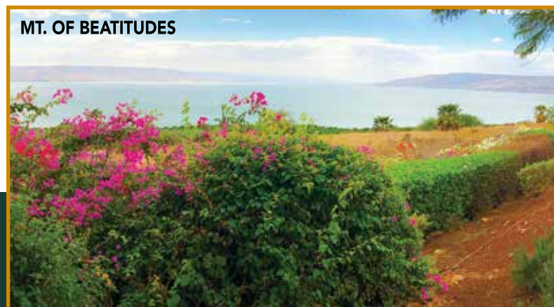
MT. OF BEATITUDES