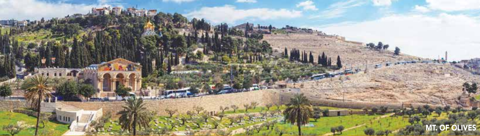
MT. OF OLIVES