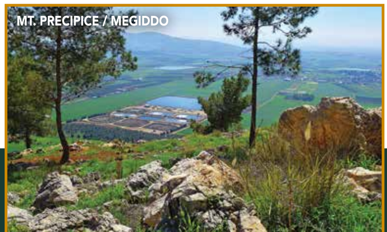
MT. PRECIPICE / MEGIDDO